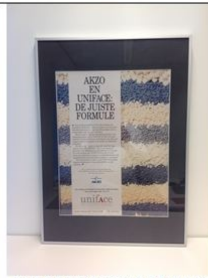
From the famous Elsevier campaign in the Netherlands in 1992