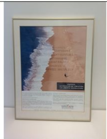
The first "Managing Change" campaign from France in 1995.